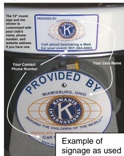
Example of signage as used by Kiwanis